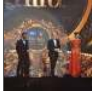
#InsidellFA: Kevin Spacey Does The Lungi Dance With Deepika Padukone!