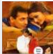
Sunday Classic: 7 Reasons to Love Hum Dil Chuke Sanam!