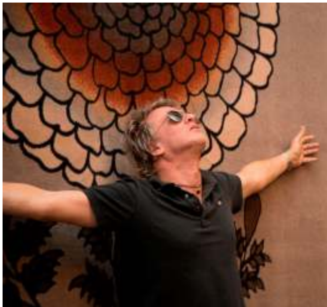
Designer Rohit Bal againsts his creation for Ege Carpet