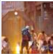
#InsidellFA: Sidharth Malhotra Ain't No Shy Guy!