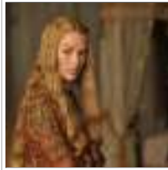
Decoding The Game of Thrones S4 Style Quotient: 4 Steps to Get The Hair