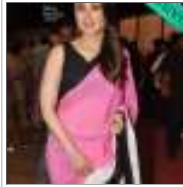
Did Kareena Kapoor Ignore Priyanka Chopra?