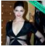
What Does Deepika Padukone Know About Katrina Kaif's Absence?