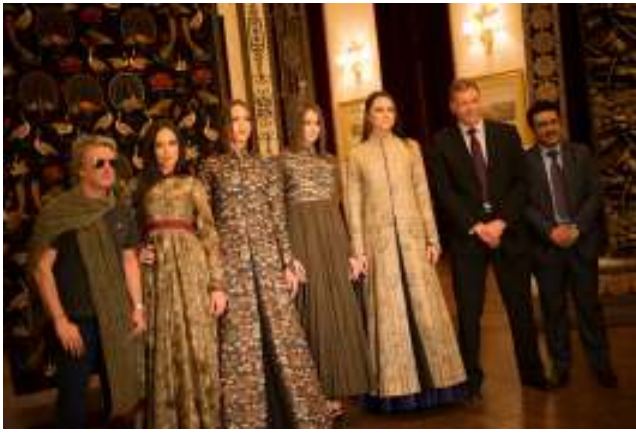
The Indian Carpet story by Ege and Rohit-Bal